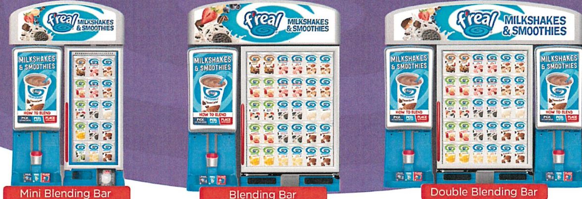
Mini Blending Bar