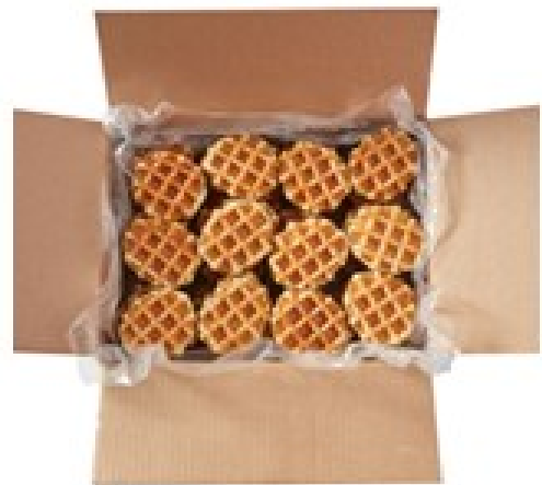
830000-PILLSBURY WAFFLE CARRIER MAPLE 6.35lb-72/CASE