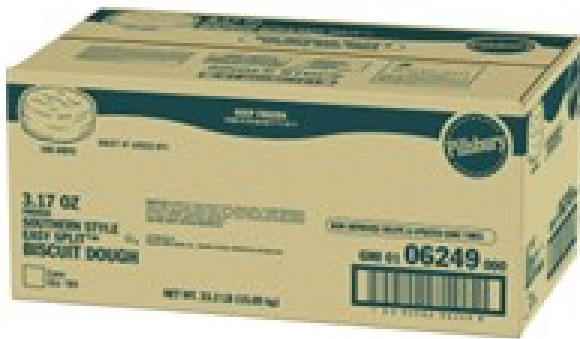
810457-PILLSBURY EZ SPLIT BISCUIT DOUGH 3.17oz-168/CASE