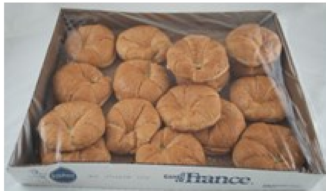
825505-PILLSBURY BAKED CROISSANT 2.5oz-64/CASE