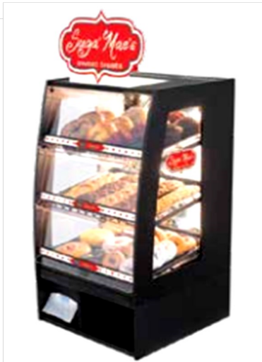
Wide Countertop 27.125"W x 23.5"D x 36"H *add 8" H for optional tissue box base