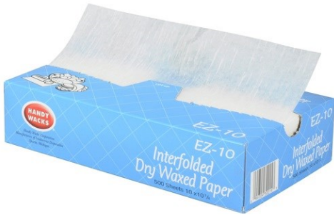
827956 - DELI WAX PAPER 10X10.75 500/BOX