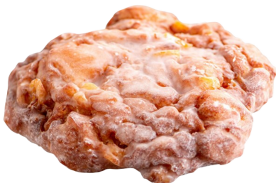
831131 - Fritter Apple Glazed - 32/CS

*ASK YOUR BTC REP ABOUT HOW TO ORDER ABOVE CASES*