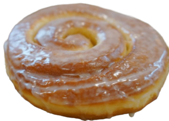
831156 - Donut Cinnamon Roll - 32/CS