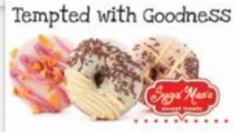
Pump Topper 20"x12"