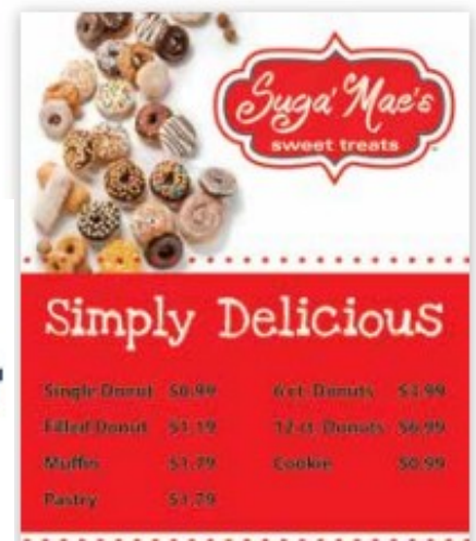
Menu Board 21"x25"