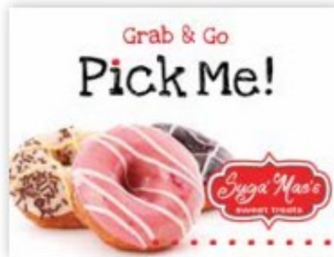
Yard Sign 24"x18"