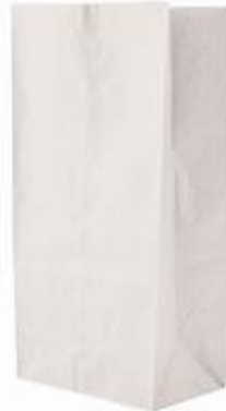
831511 - GROCERY BAG #6 WHITE - 500/BDL