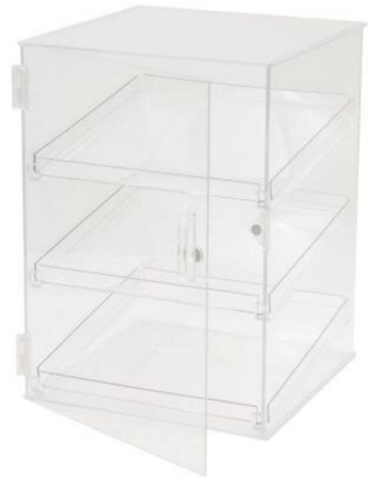
Acrylic Donut Display Case Each Shelf: 11.125" x 11.25" Dimensions: 13.5"W x 15.75"H x 13.25"D

*ASK YOUR BTC REP ABOUT HOW TO ORDER ABOVE CASES*