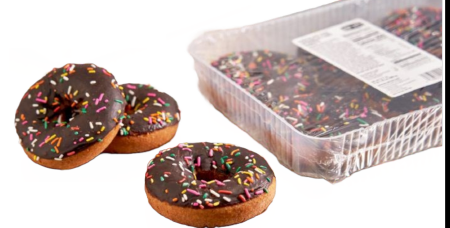
831115 - Donut Chocolate Iced Sprinkled - 48/CS