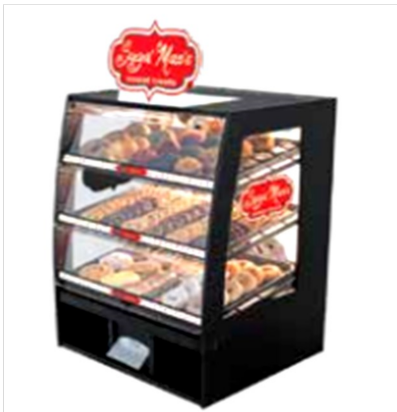
Narrow Countertop 19.5"W x 19.125"D x 28"H *add 8" H for optional tissue box base